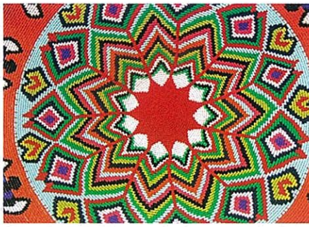
From South Africa, a telephone-wire basket