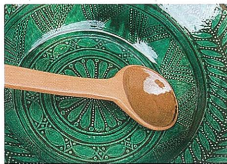
Lead-free pottery from Mexico