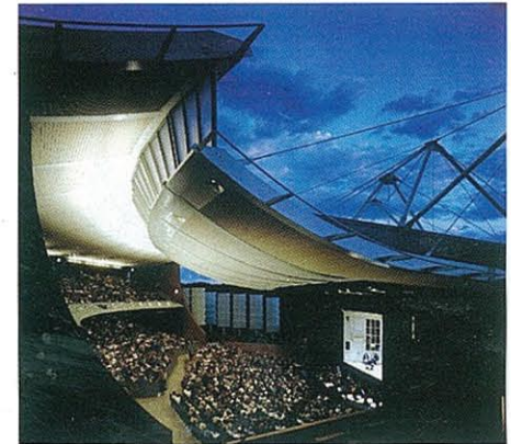
Fresh air: the Santa Fe Opera House

Sponsored by the Southwestern Association for Indian Arts, the country's largest annual sale of Native American work can feel more akin to a rock festival, as hard-core collectors and museum agents