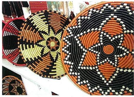
From Rwanda, papyrus baskets